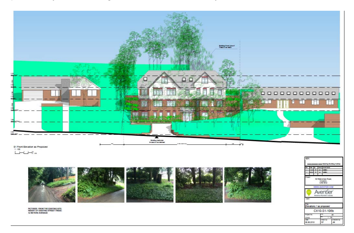
Fig 2: Elevational view highlighting the proposal in relation to neighbouring properties

nature of the site the proposed building would only appear as a two storey development when viewed from the rear, due to the fact that the lower ground floor and ground floor levels would be dug into the slope. In all other regards the proposed design of the scheme would provide a high quality built form that respects the pattern, layout and siting in accordance with Policy DM10.1.