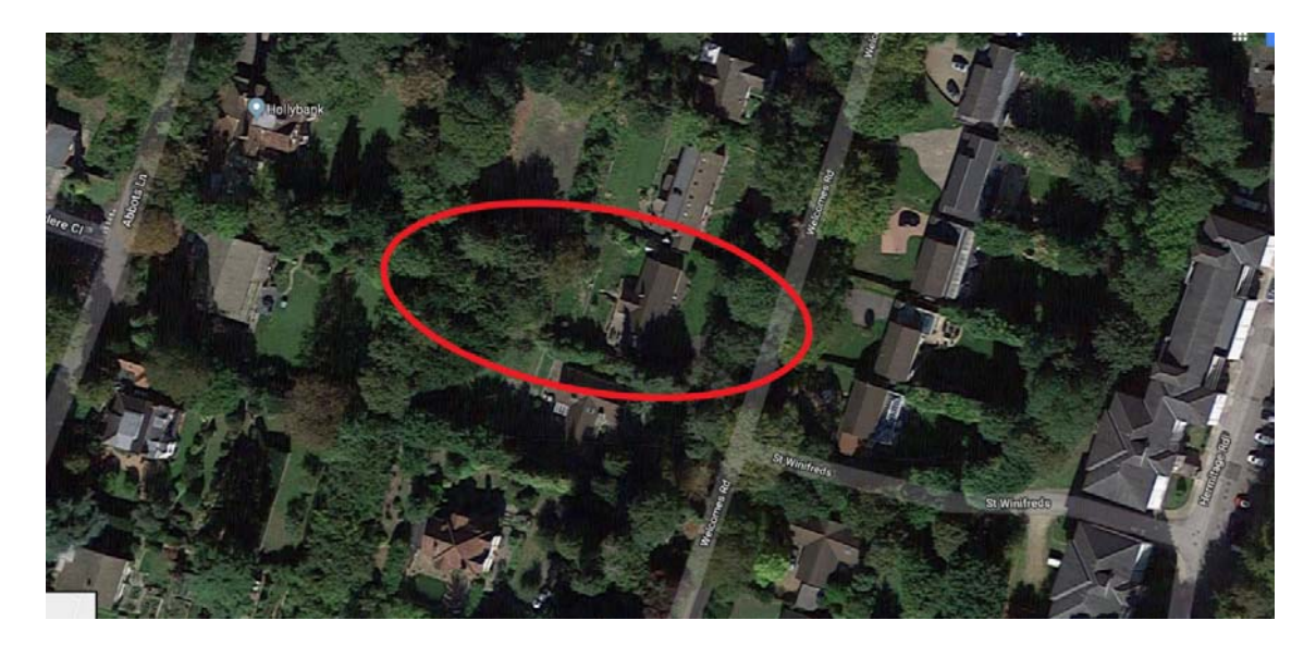
Fig 1: Aerial street view highlighting the proposed site within the surrounding street-scene